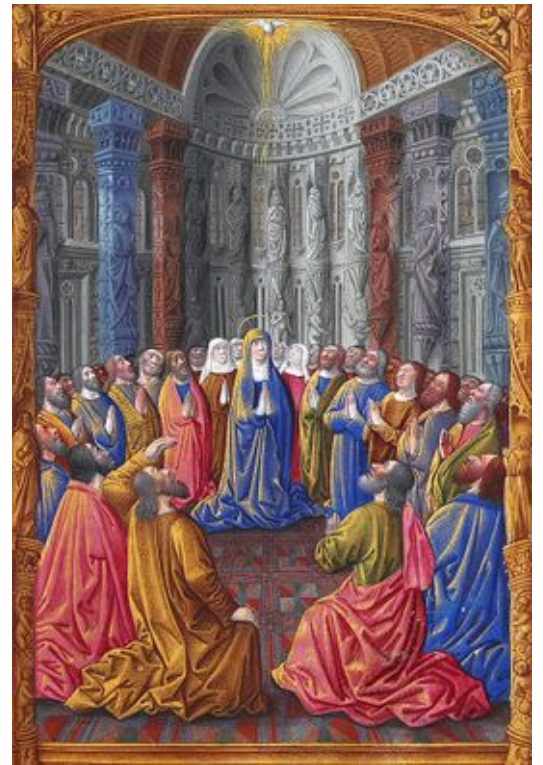
The Descent of the Holy Spirit in a 15th century illuminated manuscript. Musée Condé, Chantilly