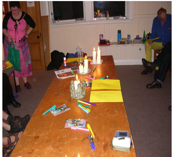
Getting creative at one of our services last year.

All: May we be makers of the peace and givers of unbounded love.