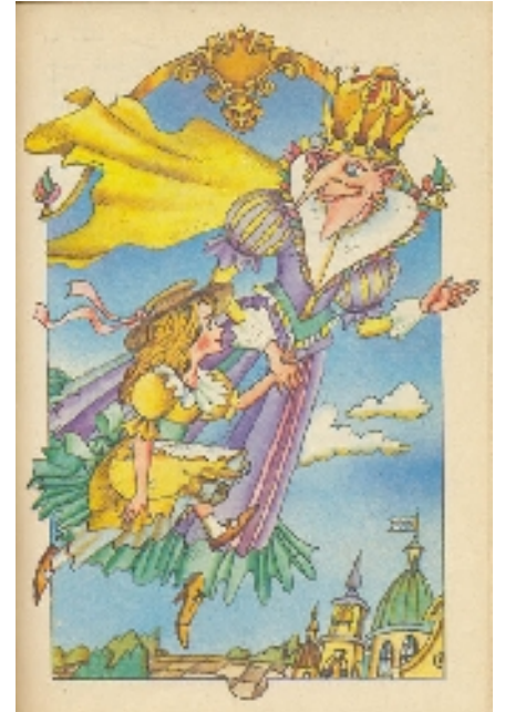
Alice and the Queen/Witch/Sphinx are off on another spiritual adventure in Wonderland.

that one day, this world may be a place where all people live in justice, freedom and peace.