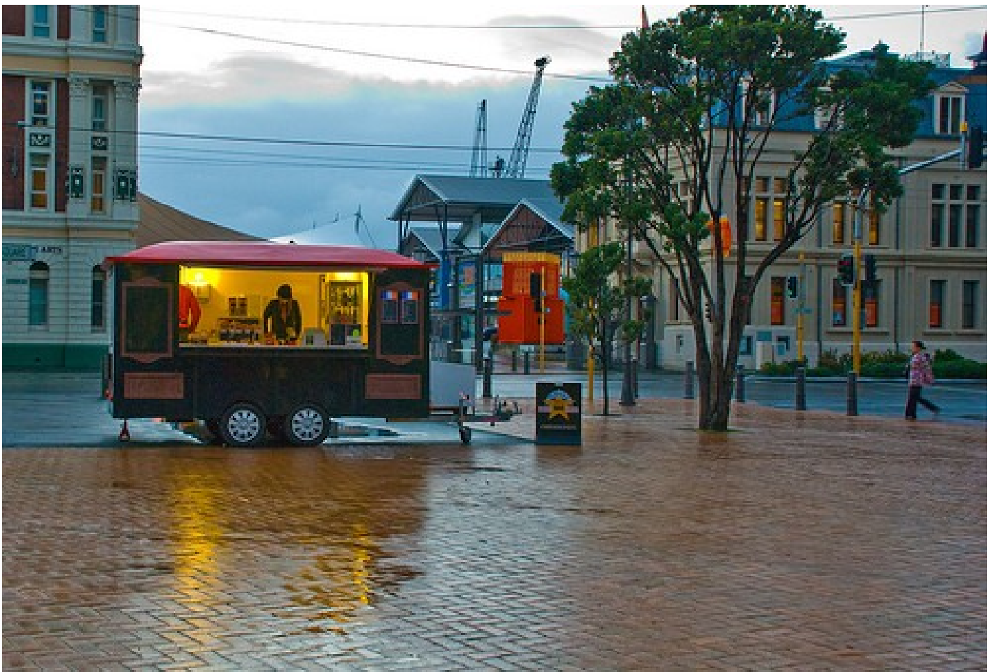
Winter in Wellington! Always a welcome somewhere