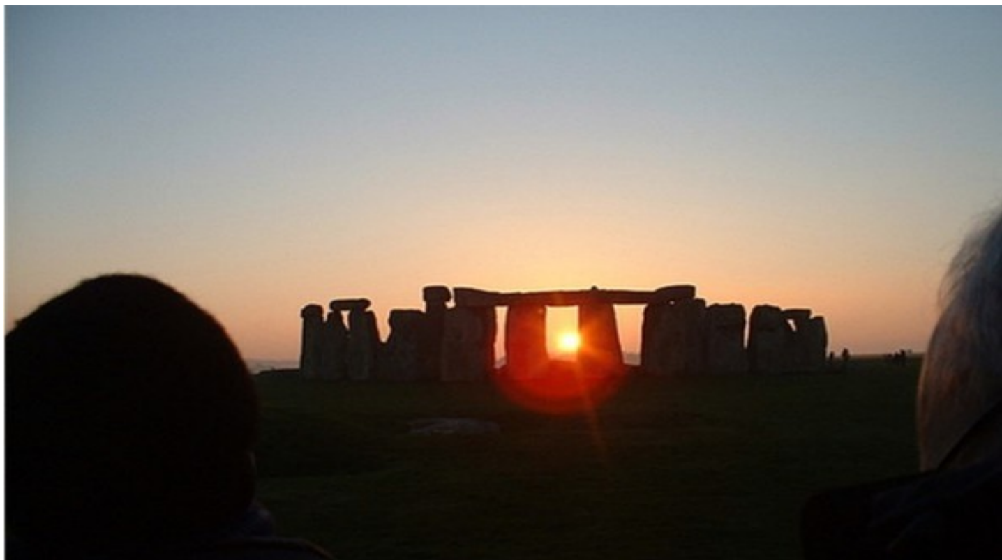
Stonehenge, United Kingdom

Leader: We have arrived at the Winter solstice, a few short days ago and we acknowledge friends who warm us - with coffee or a meal, letters from far away, the loan of a new or old and cherished book, a drink after work, e-mail messages, open fires ... and arms ... and hearts.